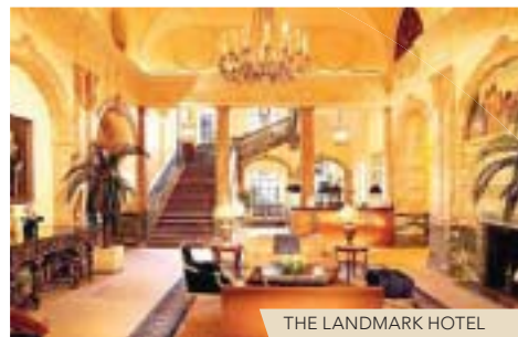
THE LANDMARK HOTEL

A charge of £695 will attach to each awards dinner attendee.