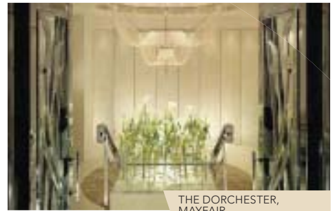
THE DORCHESTER, MAYFAIR

You are of course, free to make your own arrangements.