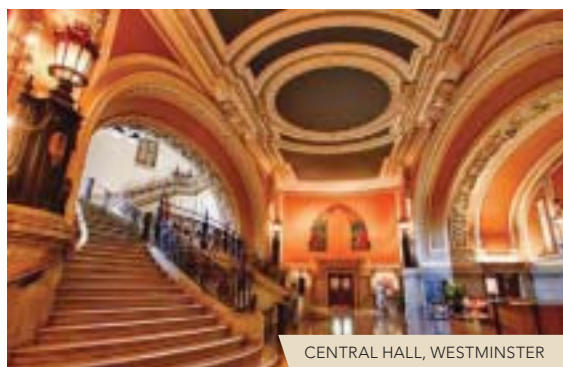
CENTRAL HALL, WESTMINSTER

The event date is Thursday 9 November 2017