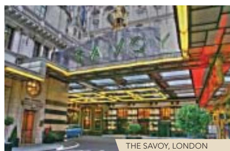
THE SAVOY, LONDON