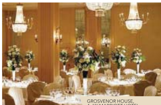
GROSVENOR HOUSE, A JW MARRIOTT HOTEL