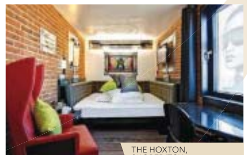
THE HOXTON, SHOREDITCH