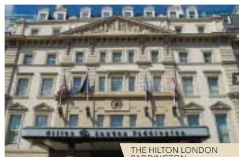
THE HILTON LONDON PADDINGTON