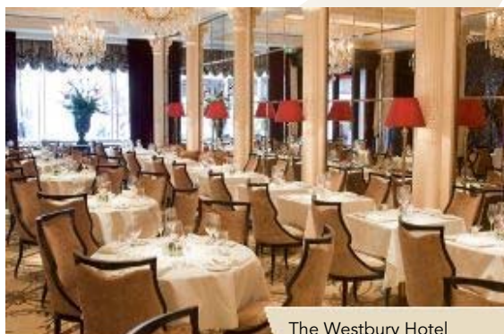
The Westbury Hotel