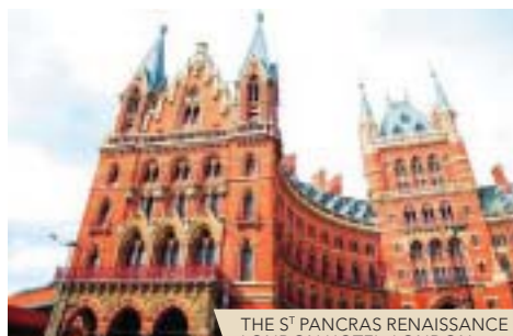
THE ST PANCRAS RENAISSANCE LONDON HOTEL, LONDON