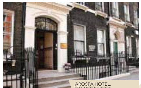
AROSFA HOTEL, GOWER STREET