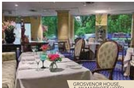
GROSVENOR HOUSE, A JW MARRIOTT HOTEL