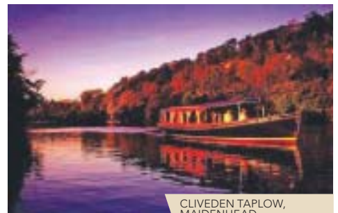
CLIVEDEN TAPLOW, MAIDENHEAD